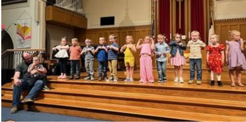
Concert Pictures of Thrilling Threes

As we end another school year, on behalf of the staff, students, and families of MSPS, THANK YOU to our church family! Without the support of KFUMC, Montgomery Street Preschool would not be possible. So thank you for your donations both monetary and supplies to the program. May we continue to bless small hearts and families for another 50 + years!!