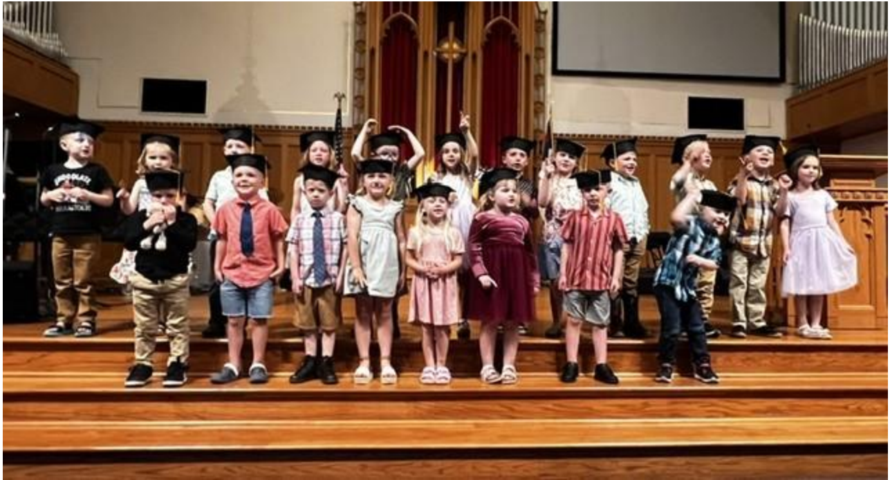
Kinder Explorer Graduates